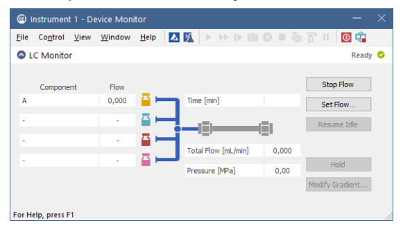
Fig 6: Device Monitor - LC Gradient

The pump status dialog can be invoked by the Monitor - Device Monitor command from the Instrument window or using the Device Monitor icon. It displays the actual flows of particular solvents, as well as the total flow, the total pressure and the analysis time.